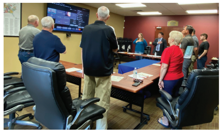
The Miami-Cass REMC board of directors and employees conducted a virtual annual meeting on June 17 in the REMC boardroom.