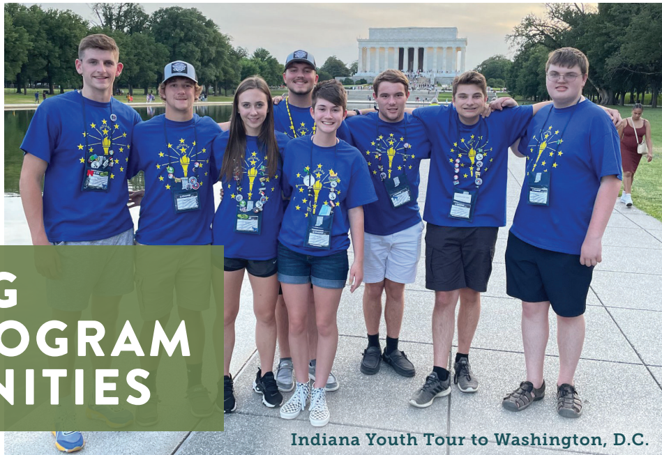
Indiana Youth Tour to Washington, D.C.